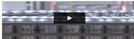
Carlsberg Case Study