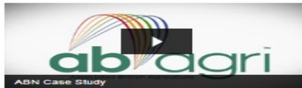
ABN Case Study